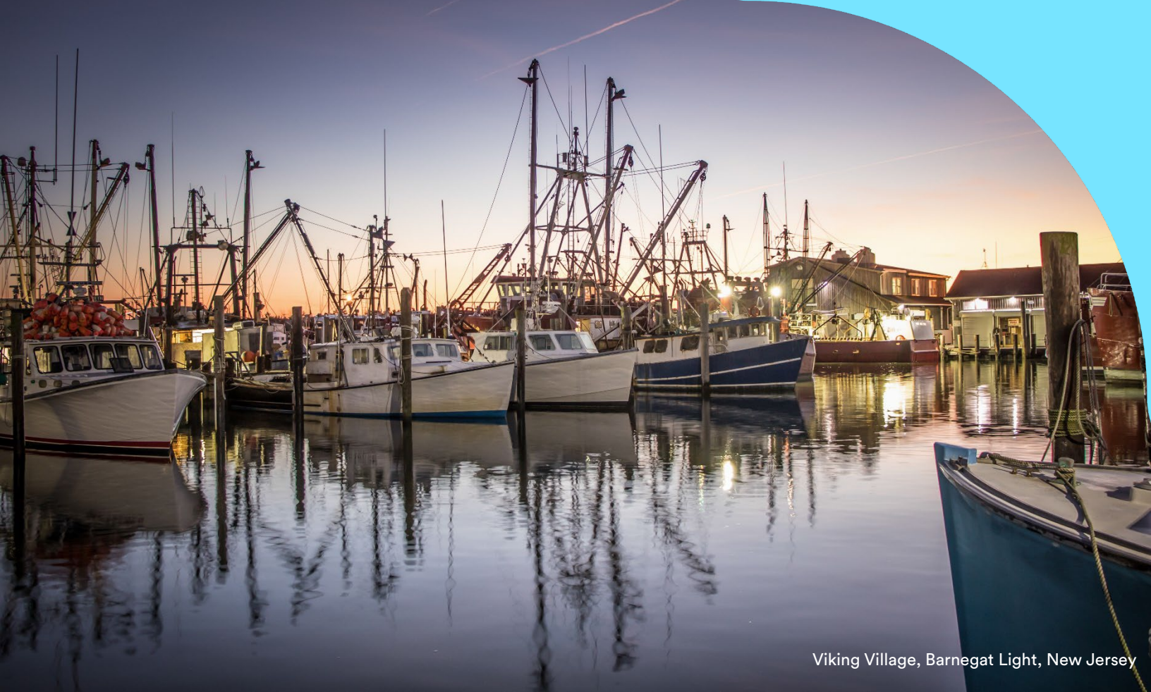
Viking Village, Barnegat Light, New Jersey